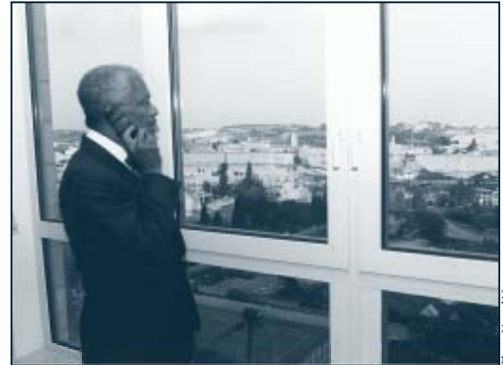
Secretary-General Kofi Annan, who travelled to the Middle East in October 2000 and met with leaders of Israel and the Palestinian Authority, is looking out at the old city of Jerusalem from his hotel room.

United Nations efforts at reaching a negotiated settlement in the Middle East conflict and securing the inalienable rights of the Palestinian people, including the right to self-determination, have been guided by, among other things, two Security Council resolutions—resolution 242 (1967) and resolution 338 (1973). Even when negotiations were held outside the United Nations framework, either bilaterally or with the involvement of regional parties and international partners, these resolutions remained key terms of reference, agreed upon by all parties as the foundation on which just and durable peace could be built.