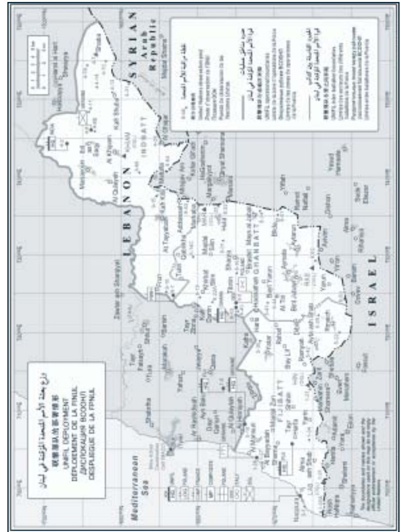
Map No. 4144 Rev. 5 United Nations July 2002

On 2 May, the Government of Israel notified the Secretary-General that Israel had redeployed its forces in compliance with Security Council resolutions. A United Nations team of cartographers worked on the ground to identify a line to be adopted for the purposes of confirming the Israeli withdrawal (subsequently referred to as the “Blue Line”). On 16 June, the Secretary-General reported to the Council that Israel had with-