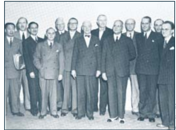
Members of the Special Committee on Palestine (shown here with two United Nations officials).

The question of Palestine was brought before the General Assembly by the United Kingdom almost as soon as the United Nations came into being. An 11-member Special Committee on Palestine (UNSCOP) was formed at the first special session of the Assembly in April 1947. The majority of the committee members recommended that Palestine be partitioned into an Arab State and a Jewish State, with a special international status for the city of Jerusalem under the administrative authority of the United Nations.