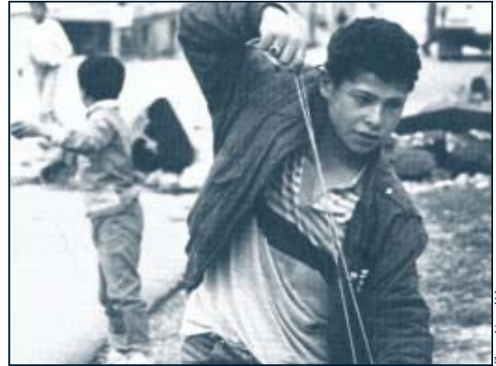
The children of Intifada, 1987-1993. A Palestinian youth at the Jalazone refugee camp, West Bank.